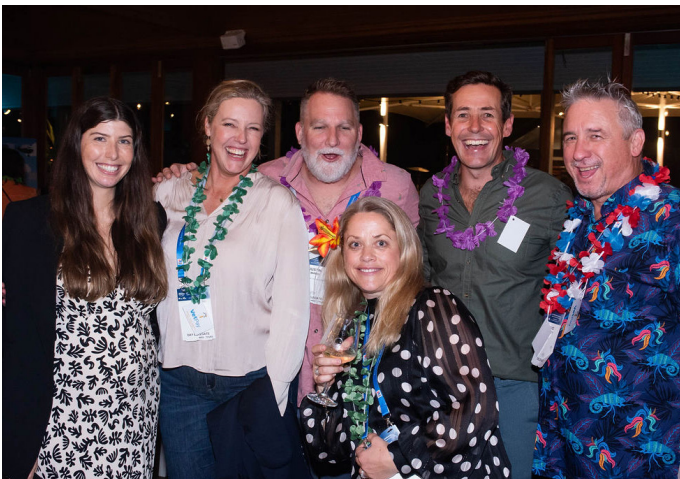
VBG members and support staff